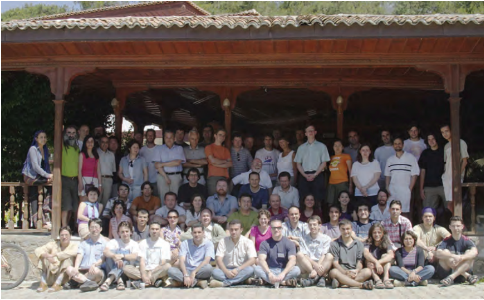
Participants of the 11 th Gökova Geometry-Topology Conference