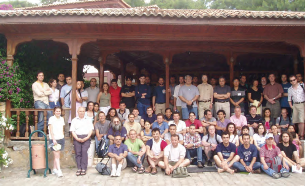
Participants of the 12 th Gökova Geometry-Topology Conference