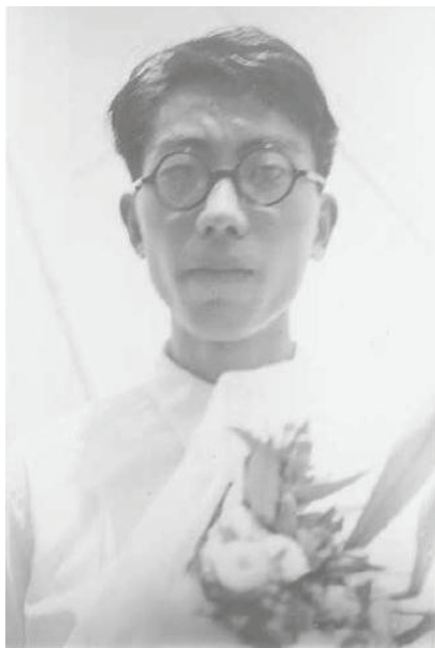
Yokohama Sea Port, August 20, 1953

I was raised in Tokyo ever since a few months after birth, so I was much eager to return to Tokyo. Even in 1948, three years after the end of the war, Tokyo was not fully recovered from the war damage. There were not enough houses, electricity, etc. People who were allowed to return to Tokyo had either jobs in Tokyo or had been admitted to high schools or universities in Tokyo. Our father returned to Tokyo, preparing for restarting his business there. Like parents of a majority of people of my generation, our parents did not receive higher education, so they depended entirely on the teacher regarding their son's advancement to a