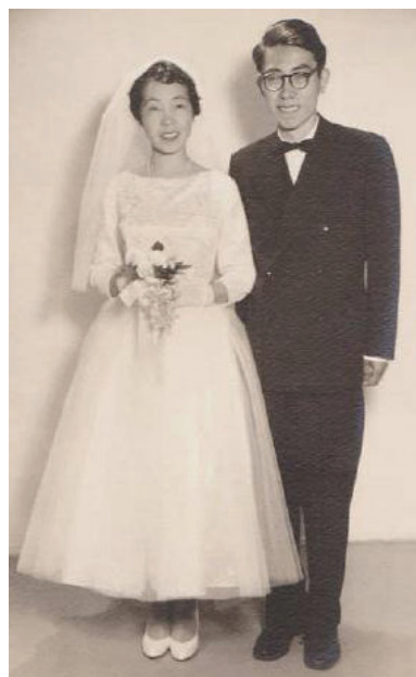
May 11, 1957, Saint Mark Cathedral, Seattle