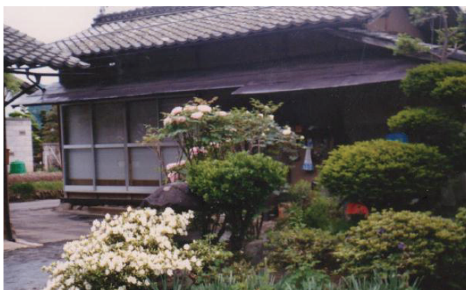
The house where the family stayed in 1947-48

In April 1944, towards the end of the war, I became a freshman of Chitose Middle School in Tokyo. This school emphasized the military training, and all freshmen were sent to Karuizawa for the training. It was still cold in April with snow remaining on the ground. We stayed in a dormitory owned by some university in Tokyo, and marched on snowy roads. So