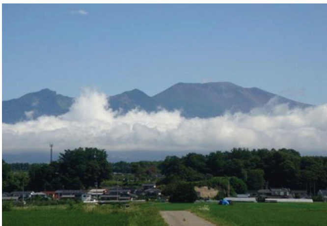
Mt. Asama viewed from Hiraga, Saku.