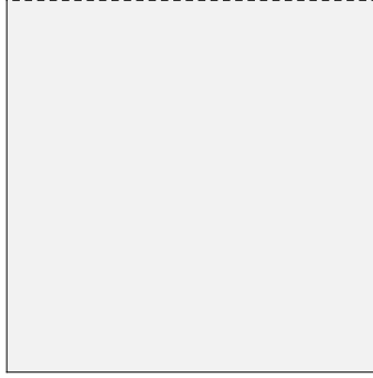
Figure 2. The area of integration.

where \varphi is given as in Section 2. Using representation (2.4) of the function f yields